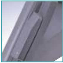
Magnetic Stripe Reader